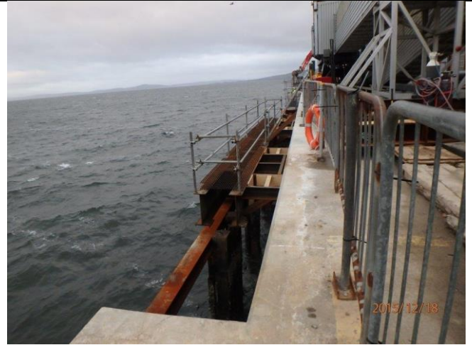
Piling "gates" being set up along cut back pier edge