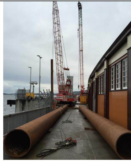
Installation of fender support piles