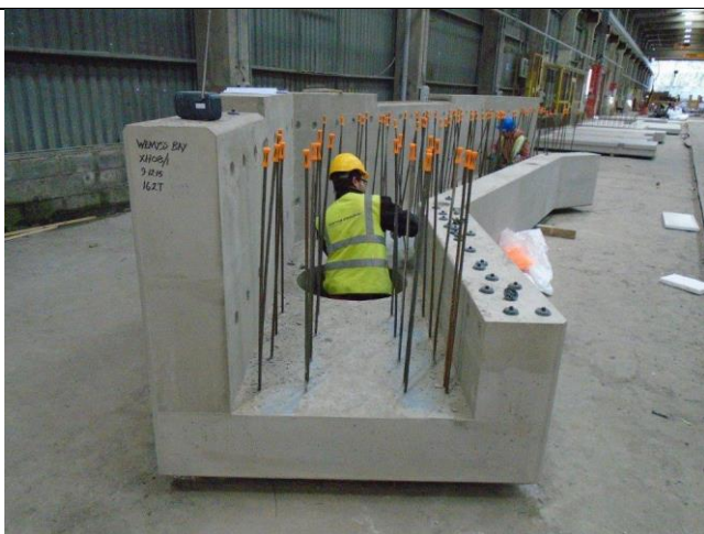
Precast concrete edge beam for new roundhead