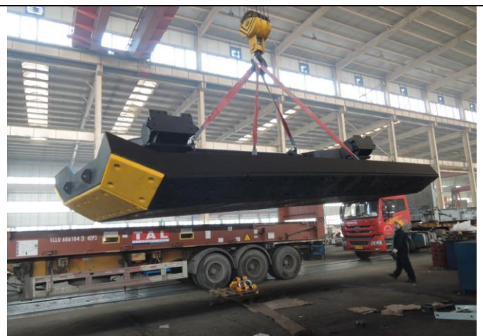
Parallel Motion Fender being loaded ready for despatch