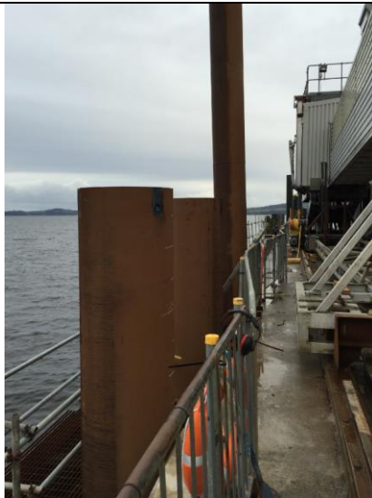
Installation of fender support piles