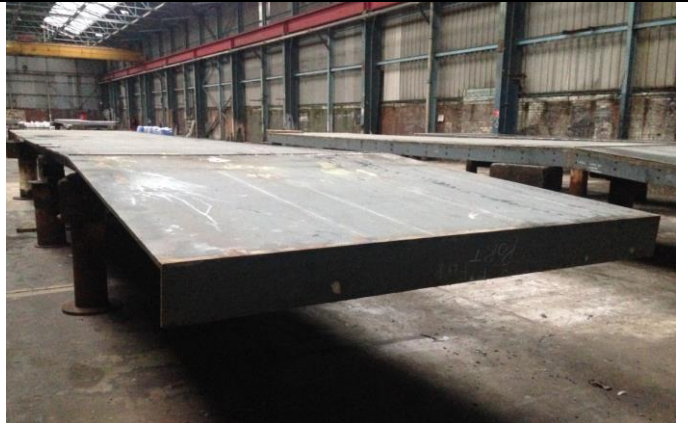
New linkspan deck panels at Inchgreen