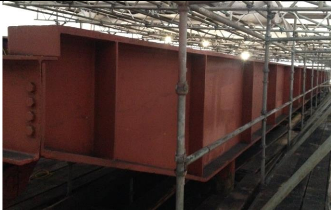
Linkspan with Primer Coat applied