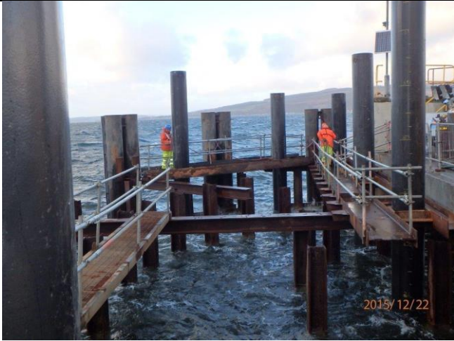
Steel bearing piles for new pier roundhead being driven